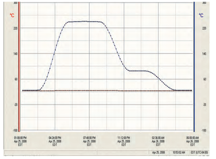
OM-CP-IFC200, $129, Windows software displays data in graphical or tabular format