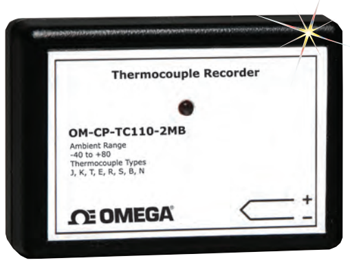
OM-CP-TC110-2MB, data logger, $299, shown actual size.