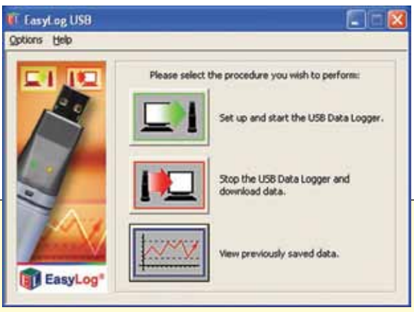
Windows software setup screen.