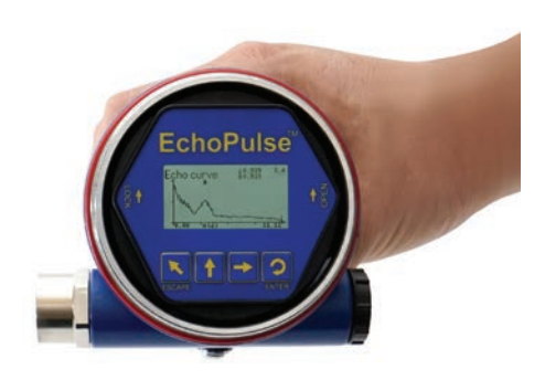
Echo Signal Return Curve Shown

- 20 2" (48mm) 5.51" (140mm) - 30 3" (78mm) 8.94" (227mm) - 40 4" (98mm) 11.34" (288mm)