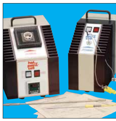
TRCIII ice point™ shown with companion CL950 dry block probe calibrator. See omega.com for details.

When accurate temperature measurements are required, the TRCIII ice point™ Chamber delivers the precision you need. The reference wells are maintained at 0°C (32°F) to within ±0.1°C and a stability of ±0.04°C for constant ambient. Continuous cycling operation maintains constant equilibrium conditions within the cell, eliminating the slow drift often experienced in common ice baths as melting