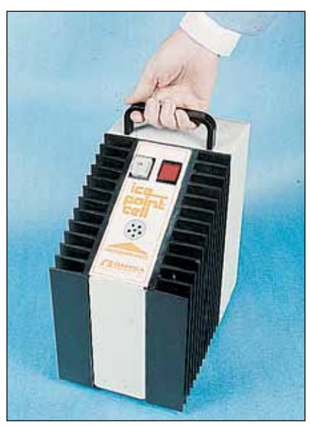
Sturdy handle for easy portability.