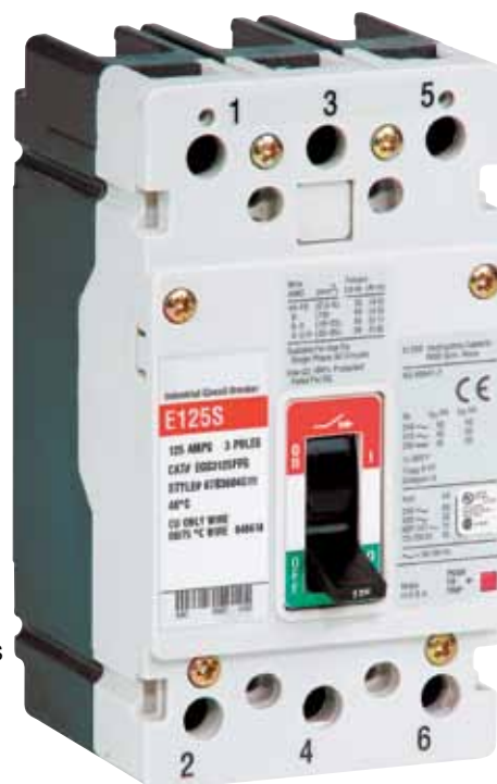
EGB3015FFG shown smaller than actual size.

As an additional switching position indicator for EG- Frame circuit breakers, there are two windows on the right and on the left of the toggle handle, in which the switching state is indicated by means of the colors red, green and white corresponding to the ON, OFF and TRIPPED positions respectively.