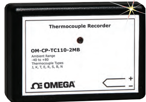
OM-CP-TC110-2MB, data logger, $299, shown actual size.