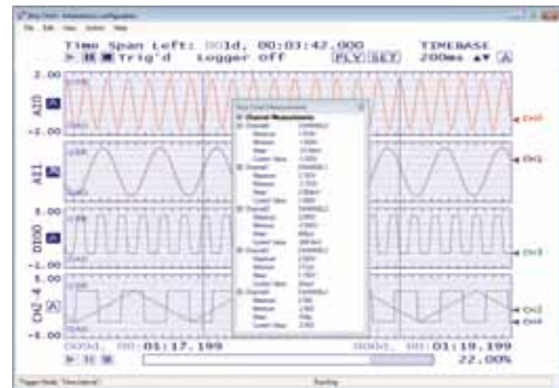
TracerDAQ Pro Strip Chart with Measurements.

TracerDAQ PRO is an enhanced version of TracerDAQ and is available as a purchased upgrade (SWD-TRACERDAQ-PRO). A comparison of some of the features included in TracerDAQ vs TracerDAQ PRO is featured below.