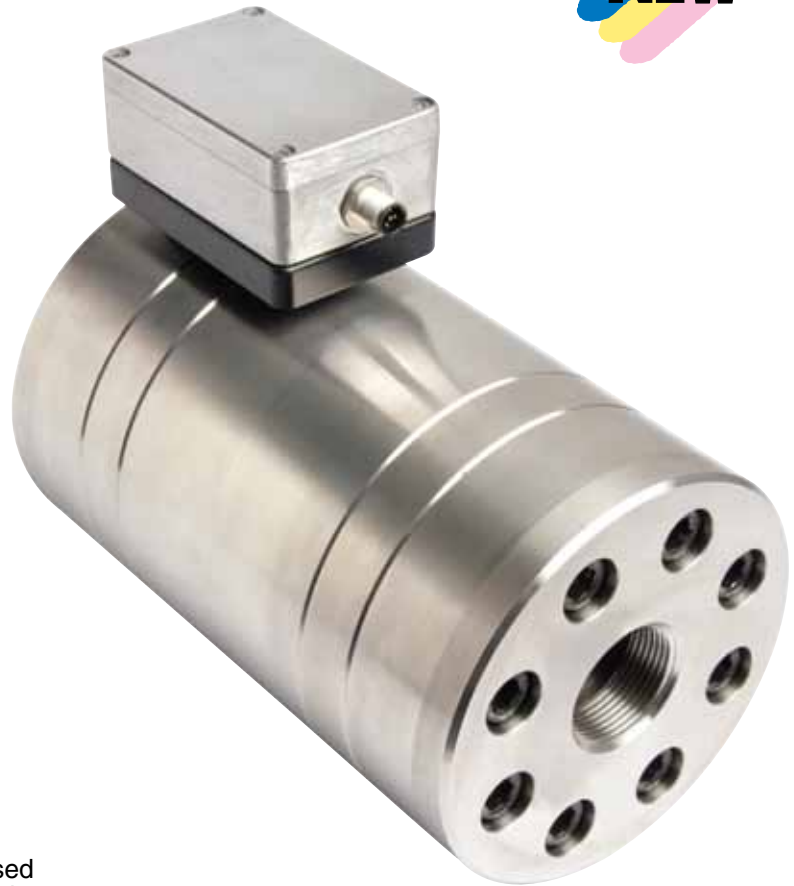
FHG-1000 shown smaller than actual size.

FHG-1000 flowmeters measure the flow rate based on the screw pump principle. A pair of rotors fitted precisely into the housing constitutes the measuring element. An integrated gear and non-contact signal pick-up system detects the rotations of the measuring element and converts them to digital pulses. Together with the housing walls, the rotor edges form closed measuring chambers in which the fluid is transported from the inlet to the outlet side. The fluid volume put through within one main rotor rotation is the rotation volume, which is divided by the sensing gear and digitized, processed and output in the sensor module.