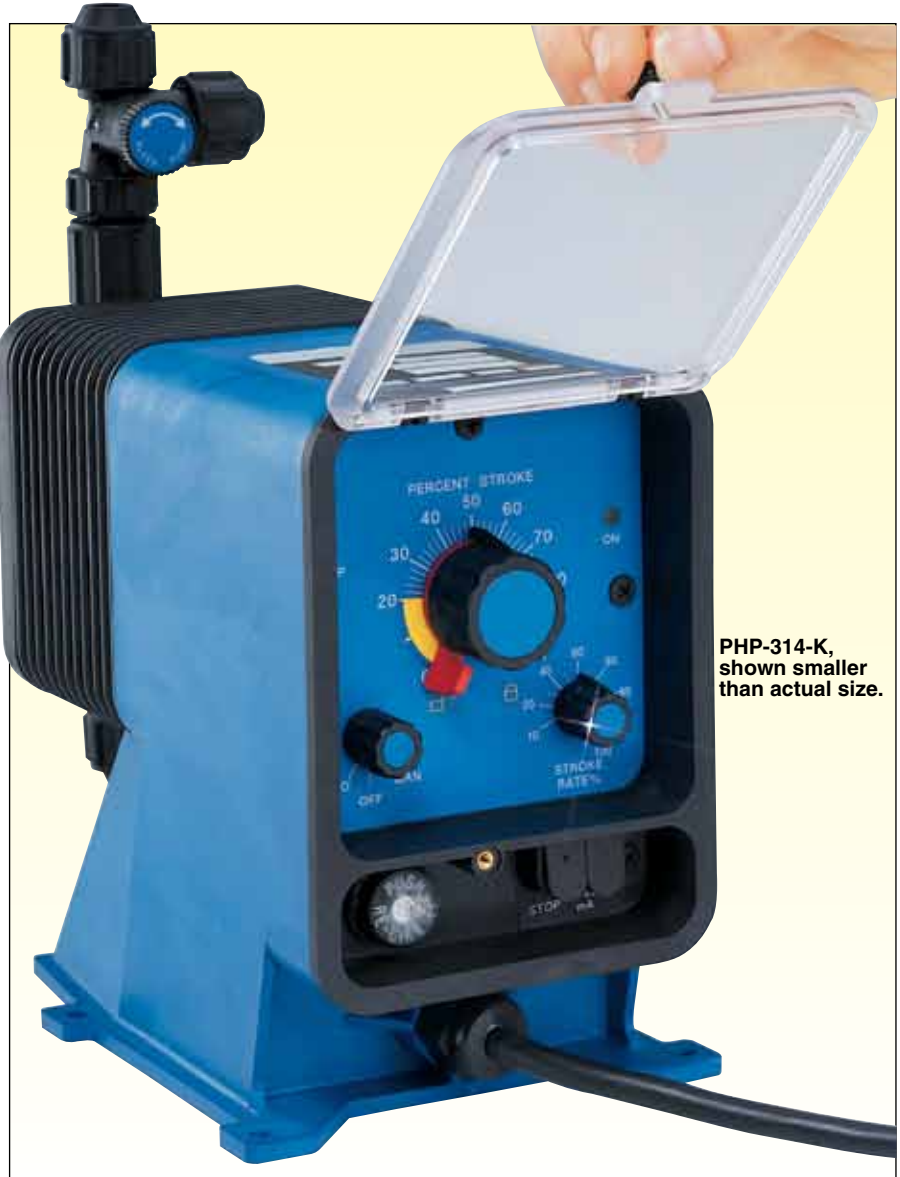
PHP-314-K, shown smaller than actual size.

Employing a 4 to 20 mA or pulse input, OMEGA's PHP-300 programmable, solenoid-driven diaphragm liquid metering pumps can be operated manually or automatically. The PHP-400 and PHP-500 Series are diaphragm liquid metering pumps designed for manual operation. The stroke length for all pumps is manually adjustable from 10 to 100% and the stroking rate from 12 to 125 strokes per minute. Head and filling material options include glass-filled polypropylene, polyvinylidene fluoride (PVDF), and AISI-316 SS. The diaphragm is made of PTFE-faced CSPE. The guided check valves provide precise seating along with excellent priming and suction lift characteristics. The PHP-310 Series incorporates all the features of the PHP-300 as well as a 4 to 20 mA input signal, while the PHP-320 accepts a pulse input signal. Every unit comes with an inlet strainer/foot valve and an injection valve. In addition, "G" and "K" models are equipped with 1.2 m (4') of PVC suction tubing, 2.4 m (8') of PE discharge tubing, and bleed valve assembly.