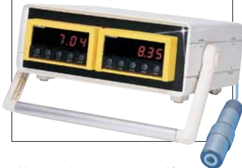
MDS37, $750, see page B-29.

pH electrodes are constructed from a special composition glass which senses the hydrogen ion concentration. This glass is typically composed of alkali metal ions. The alkali metal ions of the glass and the hydrogen ions in solution undergo an ion exchange reaction generating a potential difference. In a combination pH electrode, the most widely used variety, there are actually two electrodes in one body. One portion is called the measuring electrode, the other the reference electrode. The potential that is generated at the junction site of the measuring portion is due to the free hydrogen ions present in solution. The potential of the reference portion is produced by the internal element in contact with the reference fill solution. This potential is always constant. In summary the measuring electrode delivers a varying voltage and the reference electrode delivers a constant voltage to the meter.