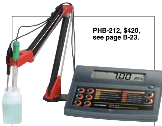
PHB-212, $420, see page B-23.

As pH values become more basic, the mV values become more negative; pH=9 corresponds to -120 mV. Dual calibration using buffers 4.0 or 10.0 provide greater system accuracy.