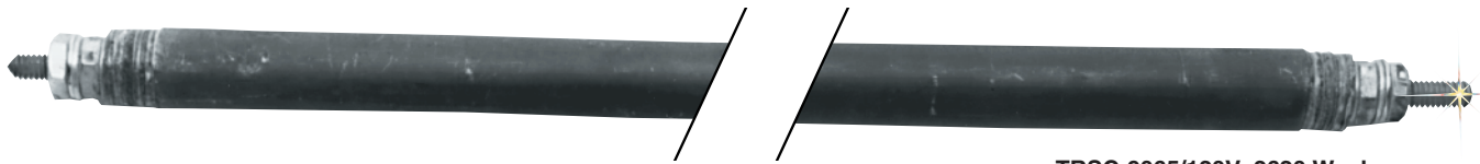
TRSC-9065/120V, 2620 W, shown smaller than actual size, $210.