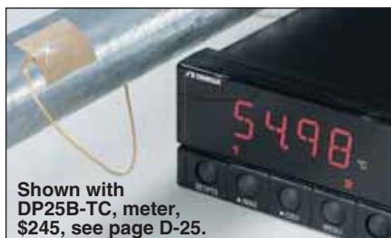
Shown with DP25B-TC, meter, $245, see page D-25.