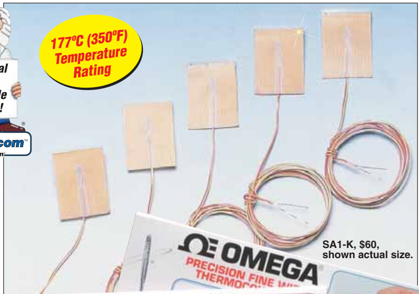
SA1-K, $60, shown actual size.