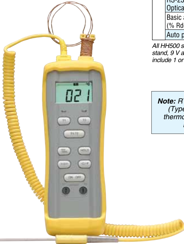
HH12B Type K Thermometer 1999 counts resolution Provides: K thermocouple Reading HOLD, MAX/MIN function Dual Input Function T1-T2 ITS-90 accuracy: \pm 0.1\%