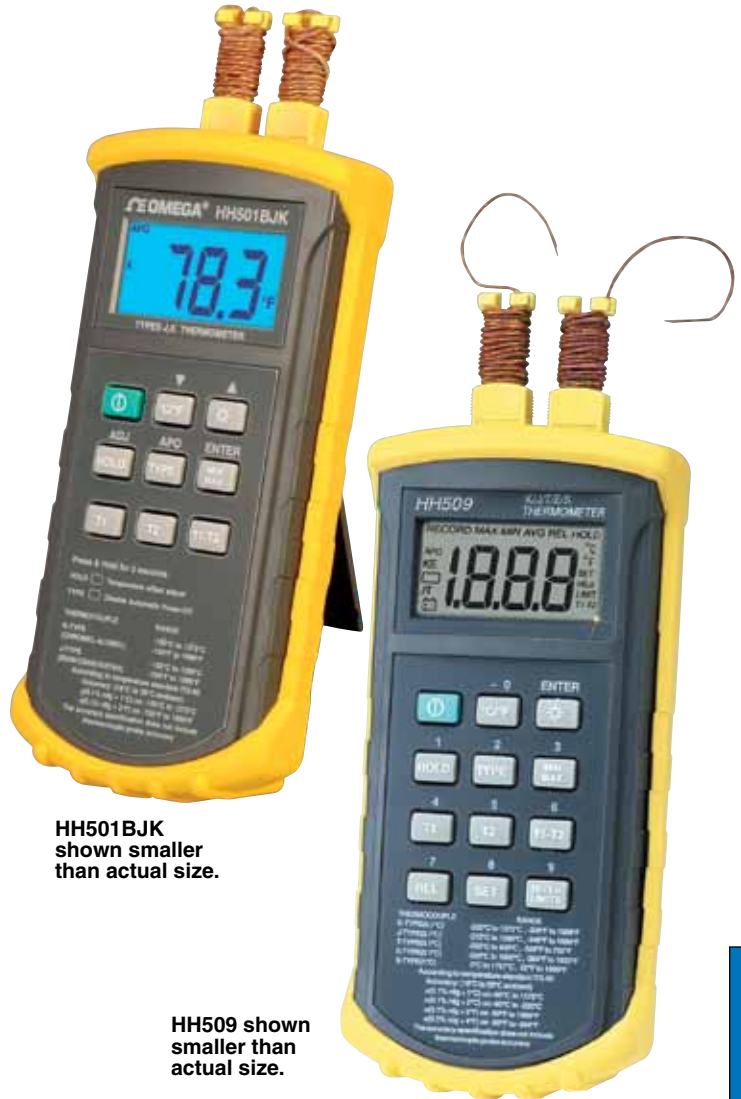
HH501BJK shown smaller than actual size.