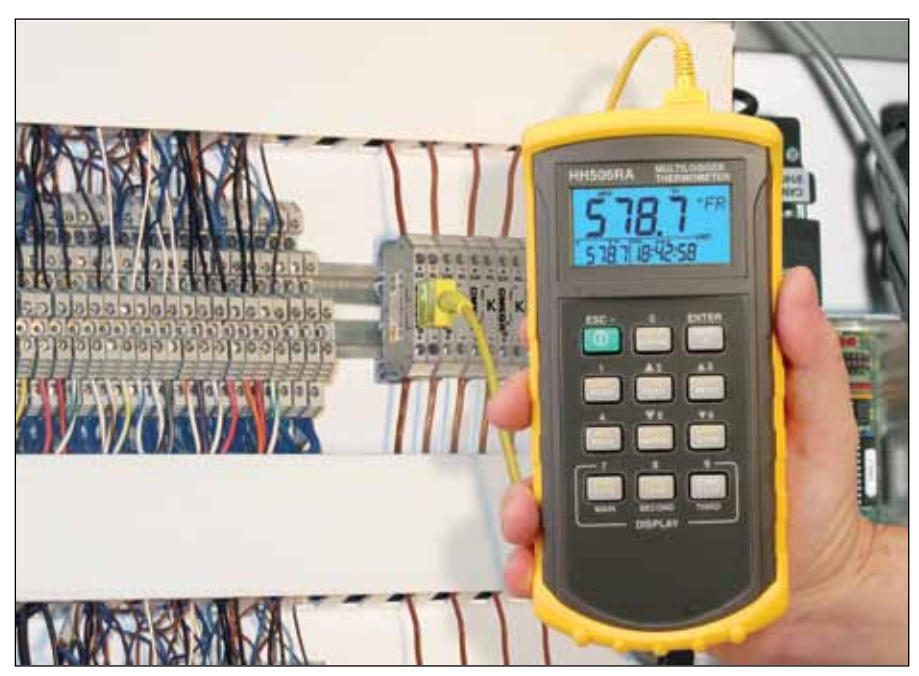
Shown with RECK1-10 cable, and the HH506RA datalogger/thermometer, with RS232C interface.

The plastic housing is made from gray polyamide 6.6 thermoplastic resin with a UL 94 VO rating for 85°C. These