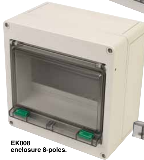
EK008 enclosure 8-poles.