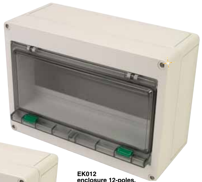
EK012 enclosure 12-poles.

The EK Series polycarbonate enclosures are a unique design to house and protect standard IEC components, such as DIN rail mount circuit breakers, timers, switches, meters and other control devices. The unique cover design features a shrouded cut-out and transparent hinged doors with push release doors latches, for quick access and visibility. The shrouded cut-out, spanning the width of the cover, exposes mounted components for easy adjustment and isolates wiring for increased safety.