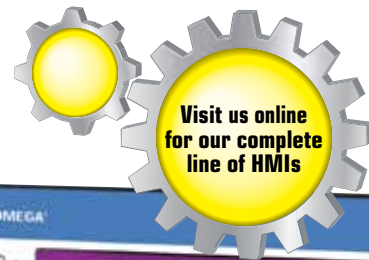
G3 Series HMI, shown smaller than actual size.