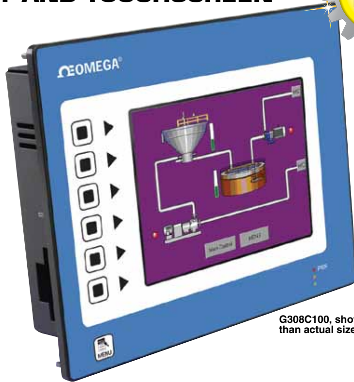
G308C100, shown smaller than actual size.

The G308 Operator Interface Terminal combines unique capabilities normally expected from high-end units with a very affordable price. The G308 is able to communicate with many different types of hardware using high-speed RS232/422/485 communications ports and Ethernet 10 Base T/100 Base-TX communications. In addition, the G308 features USB for fast downloads of configuration files and access to trending and data logging. A CompactFlash socket is provided so that Flash cards can be used to collect your trending and data logging information as well as to store larger configuration files. In addition to accessing