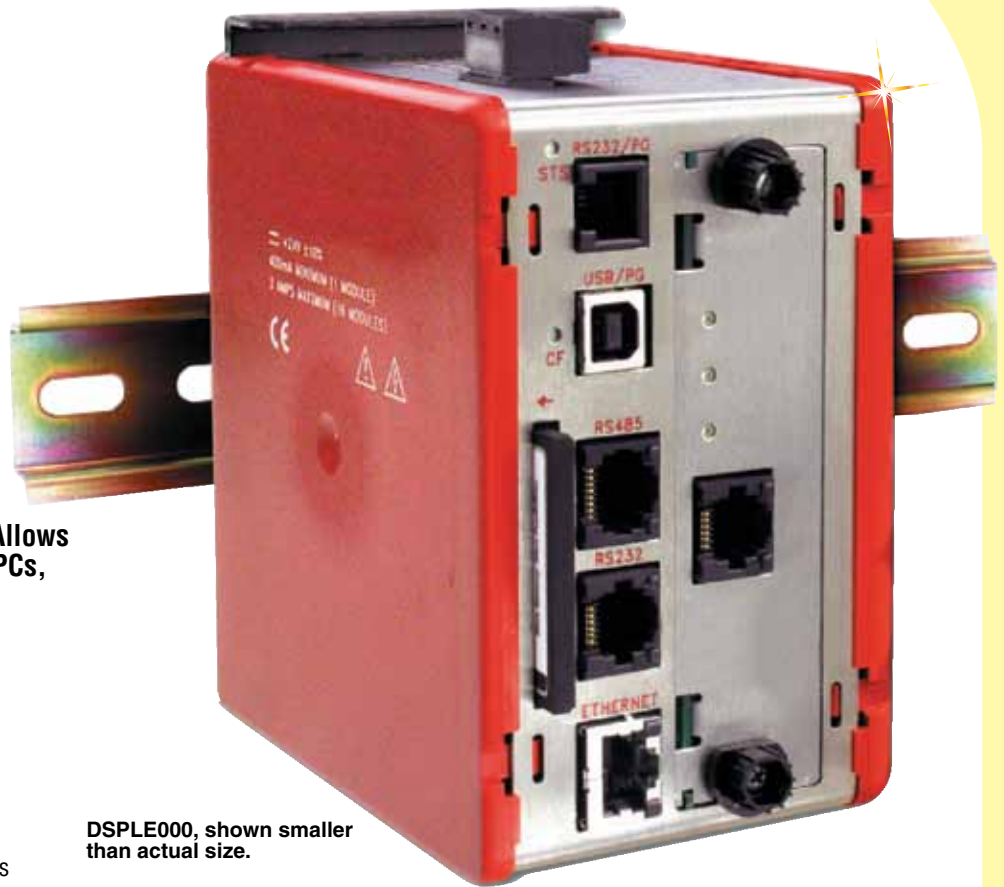
DSPLE000, shown smaller than actual size.

The DSPSX000 and DSPGT000 offers several additional features beyond those offered by the DSPLE000. The CompactFlash® card allows data to be collected and stored for later review. The files are stored in simple CSV file format allowing common applications, such as Microsoft Excel and