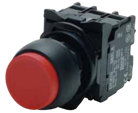
OMPBD7P-E4PX10 plastic pushbutton, extended button, red, momentary operation with one NO contact.