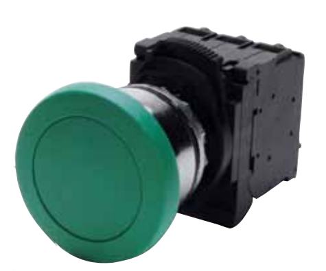
OMPBD7M-MM43PX01 metal pushbutton, 40 mm mushroom, green, momentary operation with one NC contact.