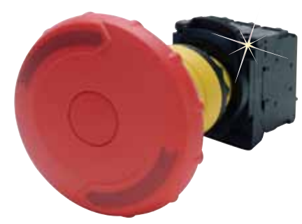
OMPBD7P-MT64PX10 plastic pushbutton, 60 mm mushroom, red, maintained operation with one NO contact.