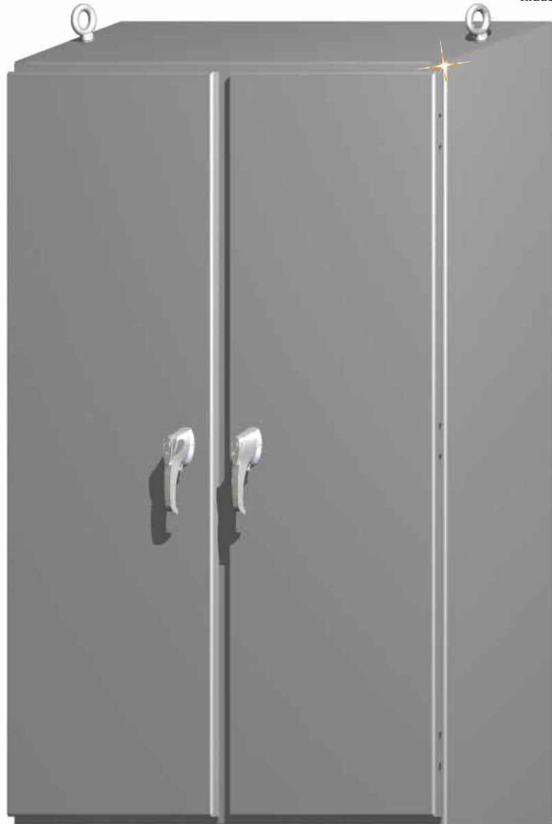
SCE-60EL4812SSST, 304 SS slope top 2 door electrical enclosure shown much smaller than actual size.

The SCE-2DST Series 304 SS electrical enclosure and control panel is designed to house electrical and electronic controls, instruments and equipment in areas which may be regularly hosed down or are in very wet conditions. The 15° slope top on these enclosures and control panels provide protection from dust, dirt, oil and strong jets of water. This indoor/outdoor electrical control panel is the solution for weatherproof applications and use in corrosive environments.