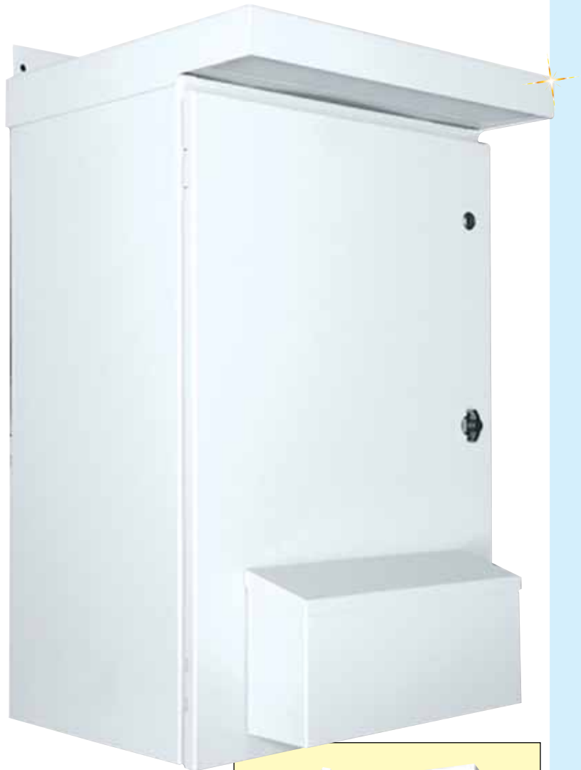
SCE-29VR2412, NEMA 3R outdoor vented enclosure with fan shown much smaller than actual size.

Finish: White powder coating inside and out; optional panels are powder coated white