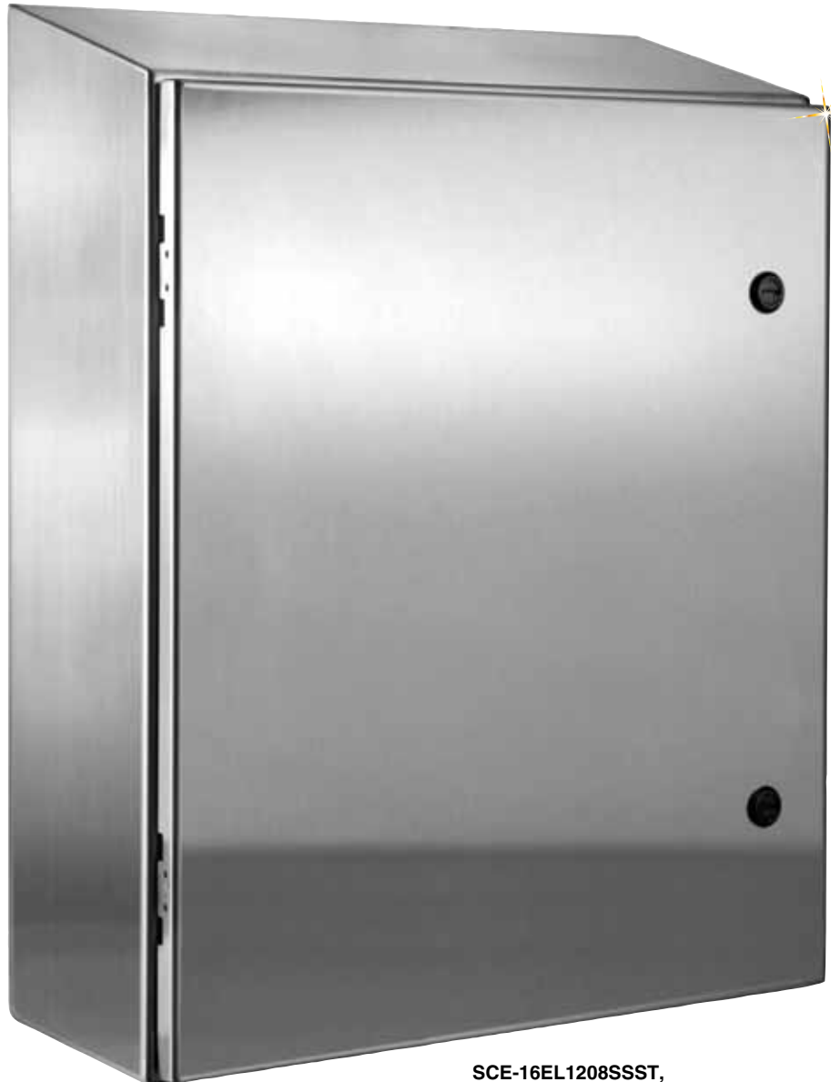
SCE-16EL1208SSST, 304 SS slope top wall mount electrical enclosure shown smaller than actual size.

The SCE-ELST Series 304 SS electrical enclosures are designed to house electrical and electronic controls, instruments and equipment in areas which may be regularly hosed down or are in very wet conditions. The 15° slope top on these enclosures and control panels provide protection from dust, dirt, oil and strong jets of water. This indoor/outdoor electrical control panel is the solution for weatherproof applications or for use in corrosive environments.