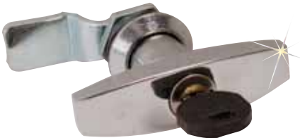
SCE-ELKLH, "T" handle.