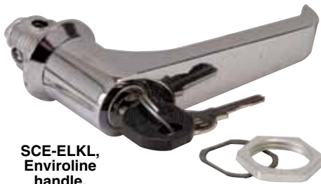
SCE-ELKL, Enviroline handle.