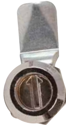
SCE-DLCA, coin proof door latch.