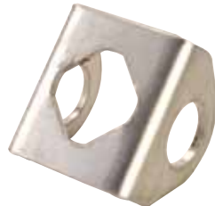
SCE-MINIQL, pad lock latch.