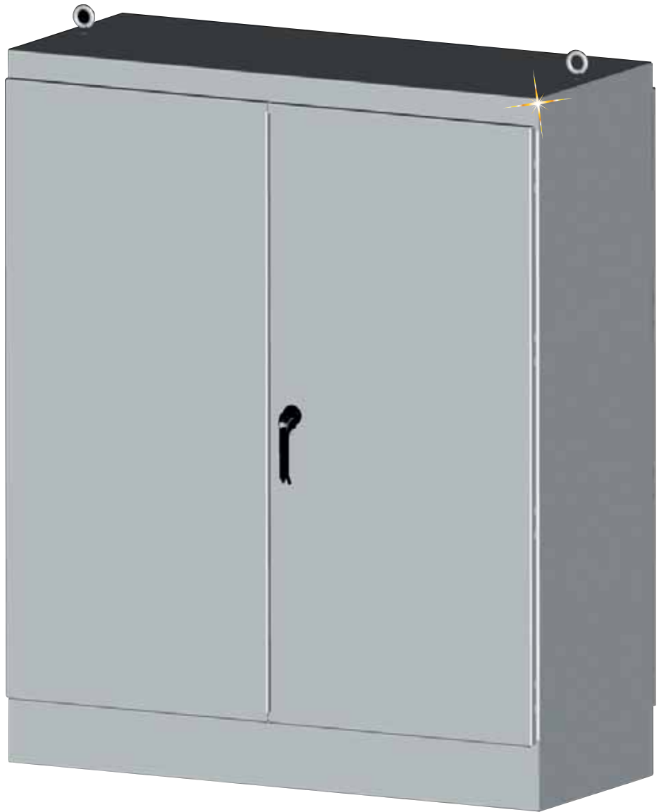
SCE-724824FSDAD shown smaller than actual size.