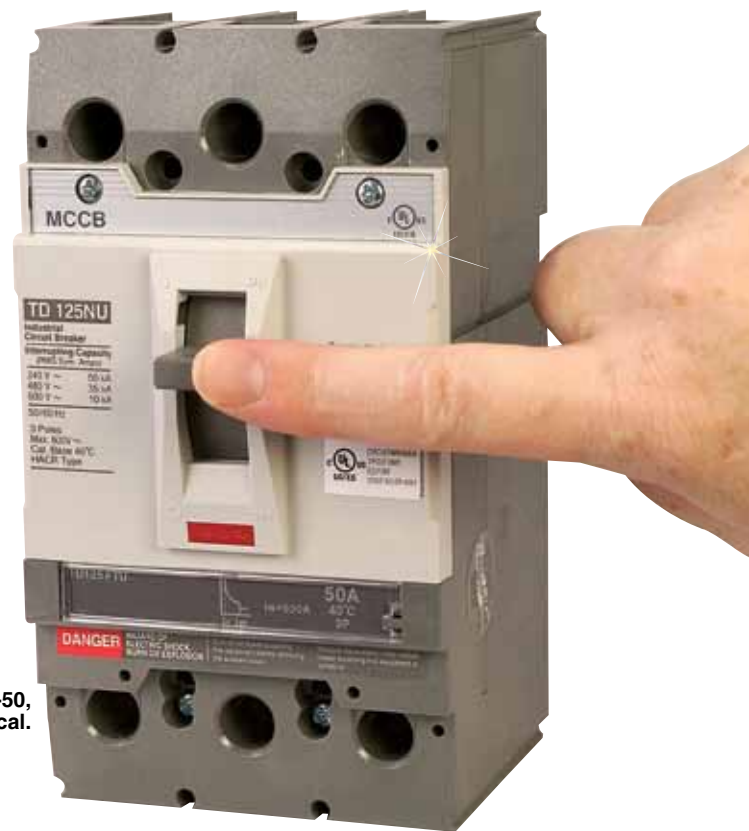
TD125NU-FTU-LL-50, 50 A MCCB electrical.

The TD/TS Series MCCB—molded case circuit breakers—main function are to protect electrical applications from short circuit or earth leakage, overload current and under-voltage conditions. These devices are used to isolate the power, or to trip the power, at the time of fault in line and thus save the circuit from further damage. MCCB's are well suited for OEM designed equipment in both light commercial and industrial applications. Their compact size saves space and reduces overall panel size and the field-installable accessories allow for last minute changes.