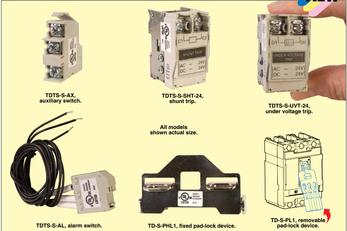
TDTS-S-AX, auxiliary switch.