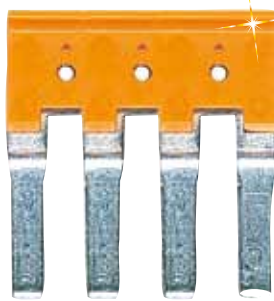
OM-476224 shown larger than actual size.