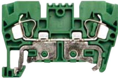
YBK-4T, shown actual size.