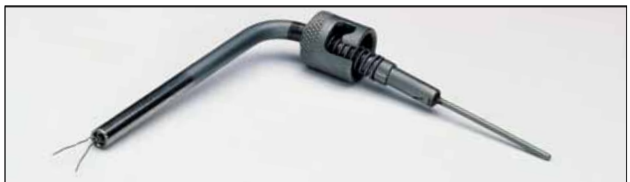
Reduced Tip Bayonet to Fit Existing Fixture