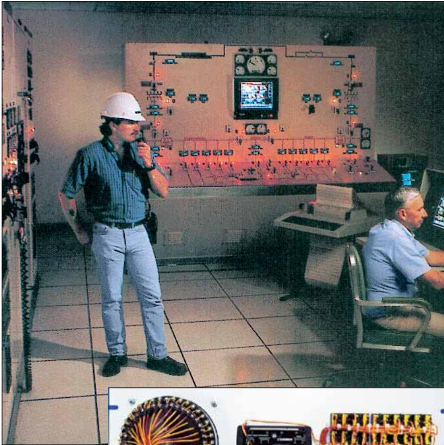
Pre-wired 483 mm (19") Panel with Switch and Meter Is Installed in Control Room.

Free Documentation Supplied for Client Proposal.