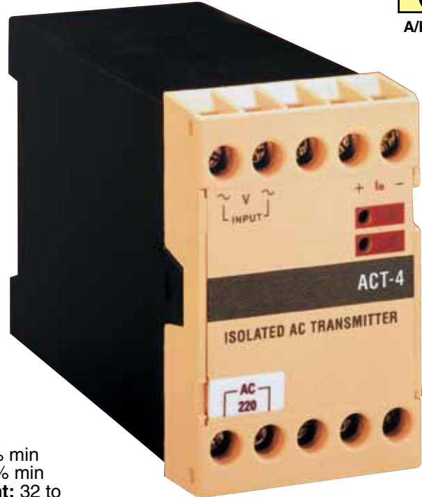
DRA-ACT-4 shown smaller actual size.

The DRA-ACT-4I AND DRA-ACT-4V Series are isolated 4-wire ac current and ac voltage input DIN rail mount signal conditioners that convert the measured input into a proportional, linear and highly accurate 4 to 20 mA output current. The DRA-ACT-4I Series of ac current input models includes models for 0 to 1 Aac and 0 to 5 Aac inputs with a 4 to 20 mA output. The DRA-ACT-4V Series of ac voltage input models includes models for 0 to 150 Vac, 0 to 250 Vac and 0 to 400 Vac inputs again with a 4 to 20 mA output. Standard instrument power is 115 Vac, 50/60 Hz. Units can also be configured for optional 230 Vac, 50/60 Hz power.