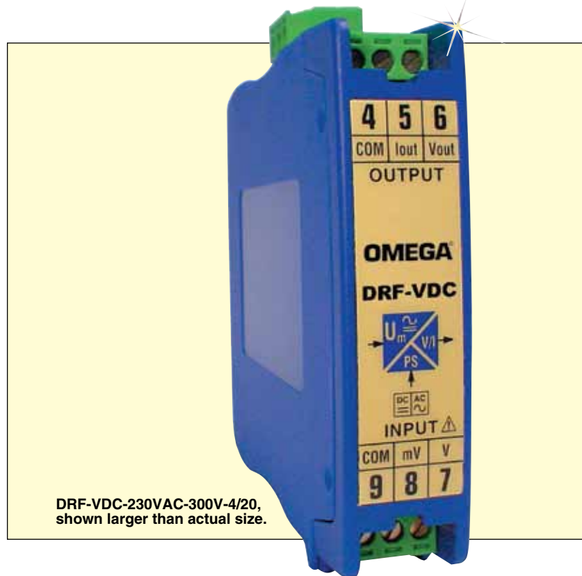
DRF-VDC-230VAC-300V-4/20, shown larger than actual size.

Over Range Protection: 1000V for ranges greater than 100V, 500V for ranges less than or equal to 100V