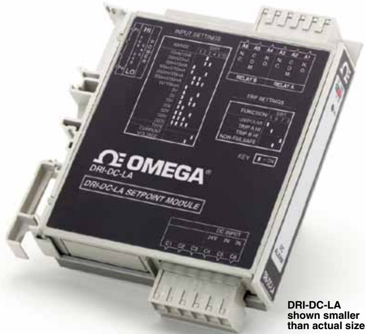
DRI-DC-LA shown smaller than actual size.

The DRI-DC-LA is a DIN rail mount, DC voltage or current input limit alarm with dual setpoints and two contact closure outputs. The field configurable input and alarm functions offer flexible setpoint capability. Input voltage spans from 10 mV to 200 V and input current spans from 1 mA to 100 mA can be field configured. Bipolar inputs are also accepted.