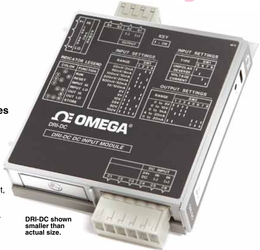
DRI-DC shown smaller than actual size.

Input Range: 20 mA (current on) Input Configuration: Unipolar Calibrated Input: 4 to 20 mA Operation: Direct (reverse off) Calibrated Output: 4 to 20 mA