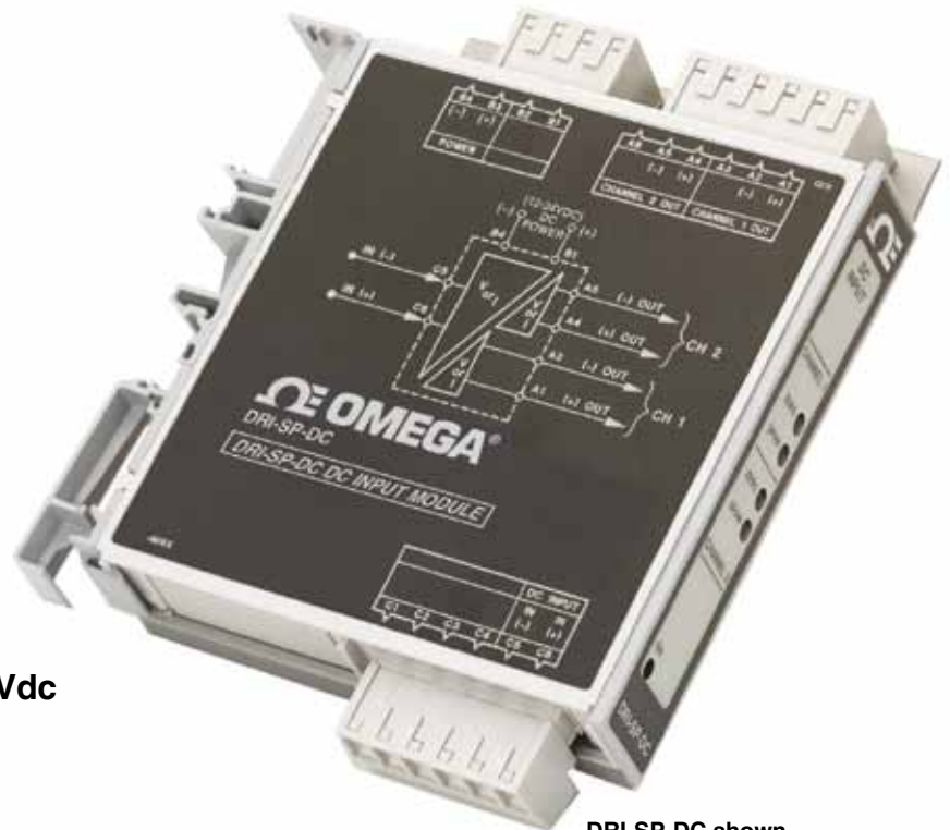
DRI-SP-DC shown smaller than actual size.

The model DRI-SP-DC is a DIN rail mount, 4 to 20 mA signal splitter, with 2000 Vac isolation between input, output and power. It provides two fully isolated 4 to 20 mA outputs in proportion to a single 4 to 20 mA input. Front accessed zero and span potentiometers allow 50% adjustment of offset and gain to compensate for sensor errors or signal losses.