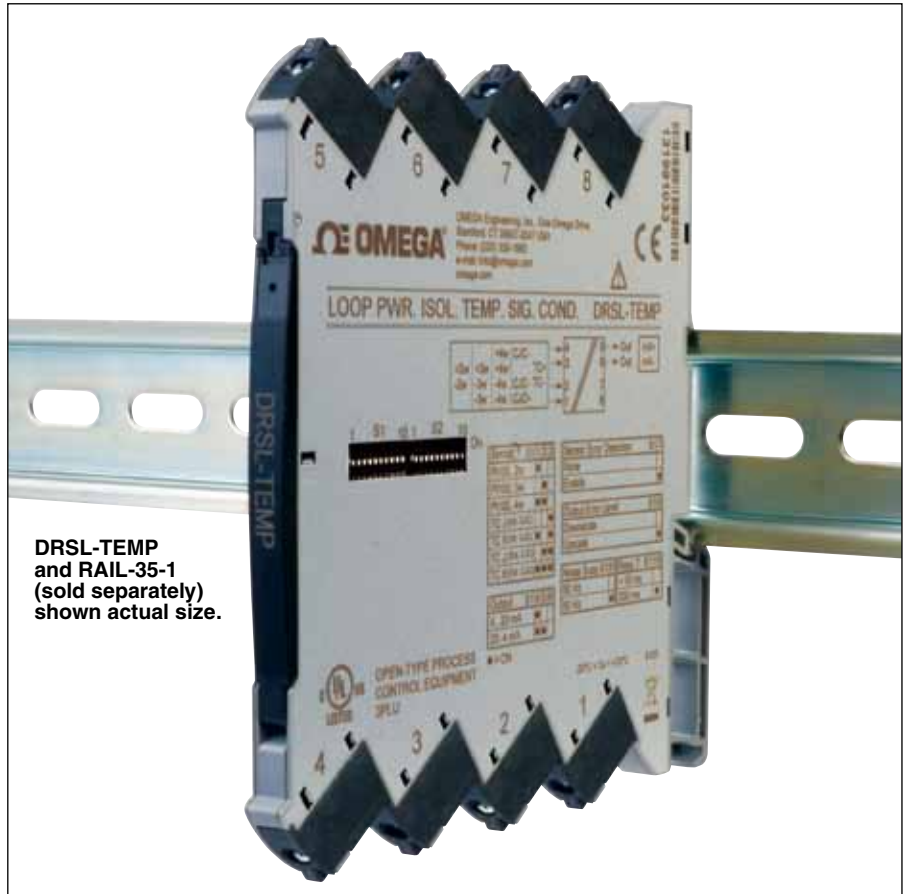
DRSL-TEMP and RAIL-35-1 (sold separately) shown actual size.