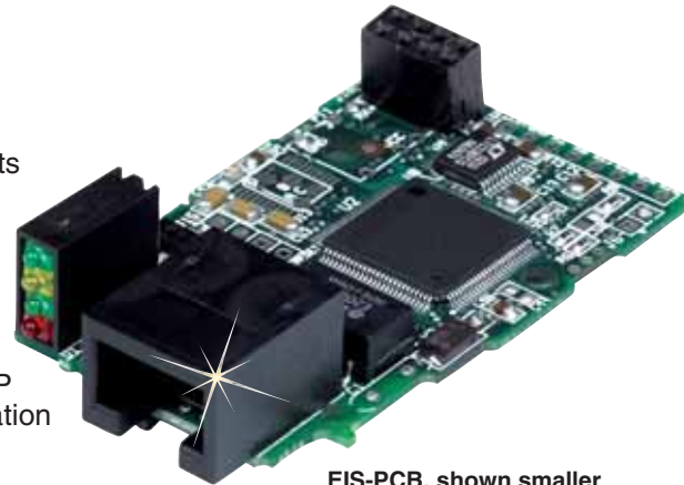
EIS-PCB, shown smaller than actual size.

For example, an electric power meter could serve a Web page that displays whatever data is available from the meter such as current