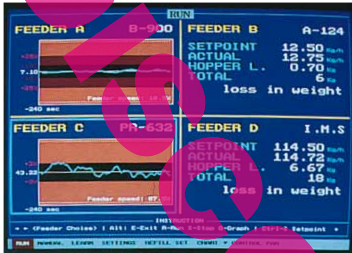
Optional LC-ANALYZE software shown.