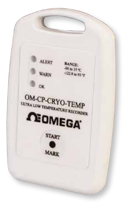
OM-CP-CRYO-TEMP. shown actual size.

Temperature Alarm: Software programmable high and low alarm limits, high and low warning limits; each setpoint may be individually enabled or disabled Alarm Delay: Software programmable time delay for warning/alarm limits; logger will not indicate out of range status until the temperature has been out of range for a set period of time