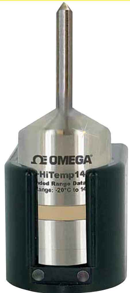
OM-CP-HITEMP140, shown in OM-CP-IFC400 docking station, shown smaller than actual size.