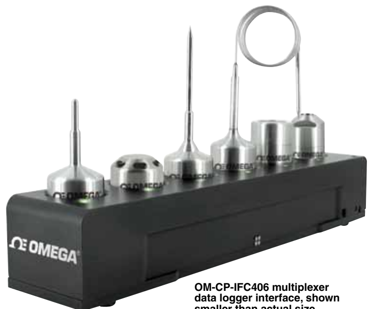
OM-CP-IFC406 multiplexer data logger interface, shown smaller than actual size.