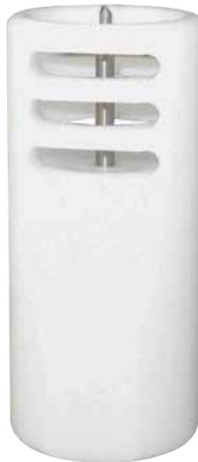
OM-CP-HITEMP140-TSK, data logger with thermal shield, shown smaller than actual size.

The OM-CP-HITEMP140-TSK is a kit that includes a OM-CP-HITEMP140 data logger housed in a thermal shield. The combined features of the \pm 0.1^{\circ}\text{C} accuracy of the OM-CP-HITEMP140 and the properties of the durable thermal shield allow the device to be used for a wide range of validation applications.