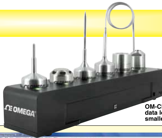
OM-CP-IFC406 multiplexer data logger interface, shown smaller than actual size.