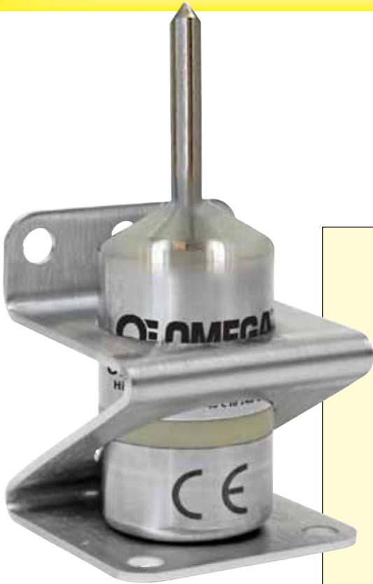
OM-CP-MULTIMOUNT-Z bracket, sold separately.