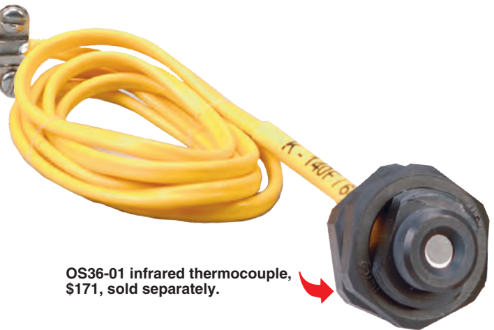
OS36-01 infrared thermocouple, $171, sold separately.

Memory: 16,383 readings per channel for a total of 32,766 readings; software configurable memory wrap Reading Rate: 1 reading every 2 seconds to 1 every 12 hours Calibration: Digital calibration through software Calibration Date: Automatically recorded within device Battery Type: 3.6 V lithium battery (included), user replaceable Battery Life: 10 years (15 minute reading rate at 25°C) Data Format: Date and time stamped °C, °F, K, °R Time Accuracy: ±1 minute/month (at 20 to 30°C) Computer Interface: PC serial or USB (interface cable required); 57,600 baud Software: WIN98/NT/2000/XP/VISTA 32-bit/7(32-bit); (VISTA/7 32-bit version only; VISTA/7 64-bit are not supported) Operating Environment: -40 to 80°C (-40 to 176°F) Dimensions: 44 x 59 x 21 mm (1.7 x 2.3 x 0.8") Infrared Thermocouple Dimensions: 3.25 L x 1.80 cm Dia. (1.28 x 0.71"); 0.9 m (36") PFA coated unshielded stranded wire Weight: 60 g (2.1 oz)