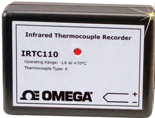
OM-CP-IRTC110 data logger with infrared thermocouple, $299, shown larger than actual size.