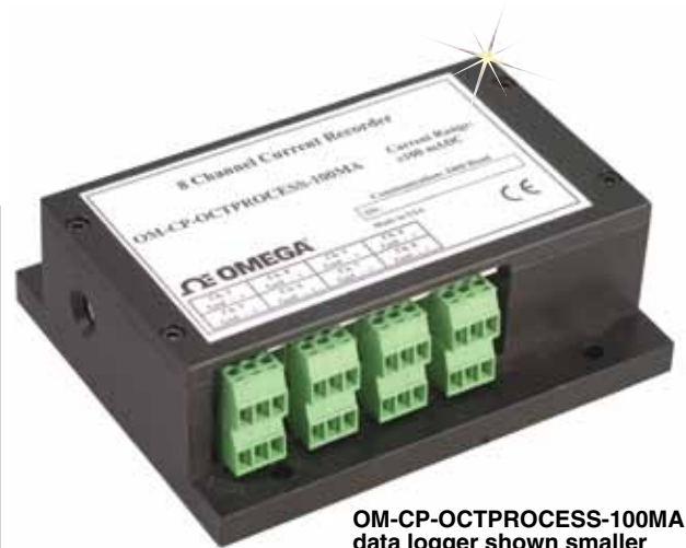
OM-CP-OCTPROCESS-100MA data logger shown smaller than actual size.