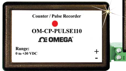
OM-CP-PULSE101, $99 and OM-CP-PULSE110, $199, data loggers shown larger than actual size

The software converts your PC into a real time strip chart recorder. Data can be printed in graphical or tabular format and can be exported to a text or Microsoft Excel file.