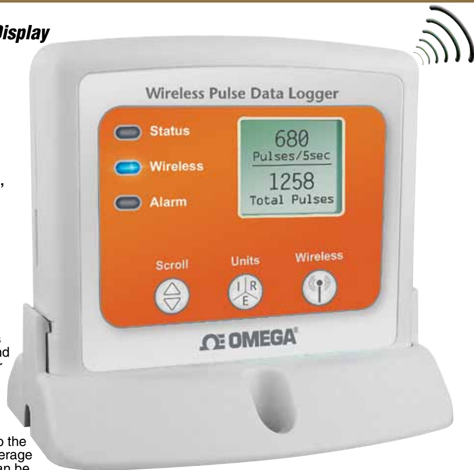
OM-CP-RFPULSE2000A shown smaller than actual size.

Data can be viewed in graphical or tabular formats and summary and statistics views are available for further analysis. The software features export to Excel®, data annotation, digital calibration and more.