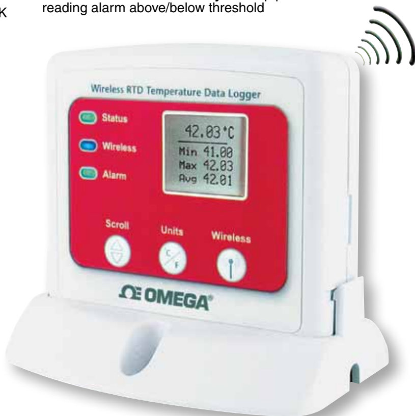
OM-CP-RFRTDTEMP2000A shown smaller than actual size.