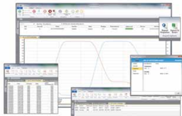
OM-CP-RFC1000-EXT, Windows® software displays data in graphical or tabular format, sold separately.

Audible Alarm Functionality: 1 beep per second for reading alarm above/below threshold