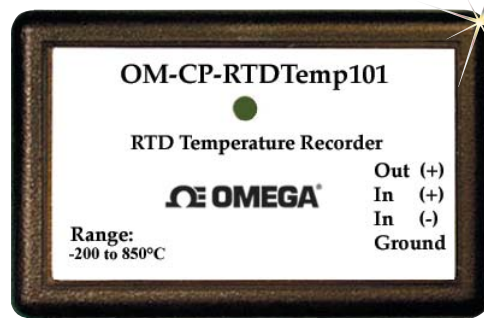
OM-CP-RTDTEMP101, $199, & OM-CP-RTDTEMP110, $299, data logger shown larger than actual size

Calibration Date: Automatically recorded within device to alert user when calibration is required