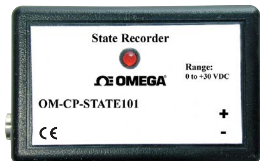
OM-CP-STATE101, $99 and OM-CP-STATE110, $199, data loggers shown smaller than actual size