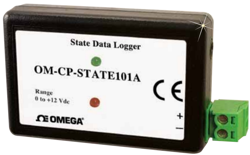
OM-CP-STATE101A shown larger than actual size.

The OM-CP-STATE101A is one of our newest data loggers. It is part of a new series of low cost, state-of-the-art data logging devices that has taken the lead in offering the most advanced, low cost, battery powered data loggers in the world today.