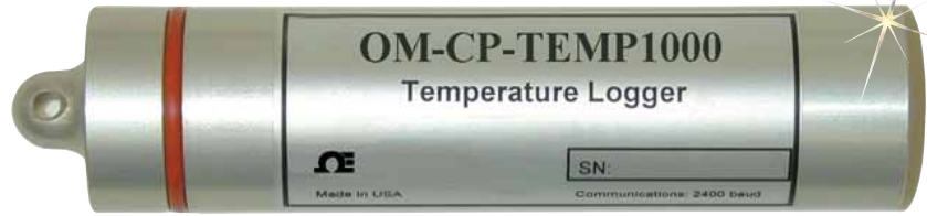
OM-CP-TEMP1000, shown actual size.

Data retrieval is simple. Plug it into an empty COM port and the easy to use Windows software does the rest. The software converts your PC into a real time strip chart recorder. Data can be printed in graphical or tabular format and can also be exported to a text or Microsoft Excel file.