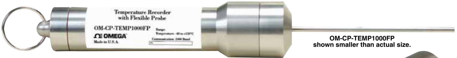
OM-CP-TEMP1000FP shown smaller than actual size.