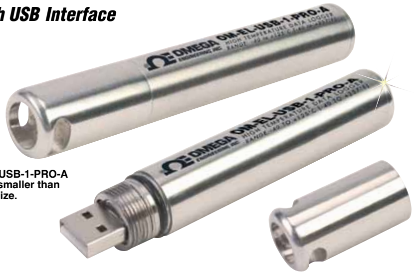
OM-EL-USB-1-PRO-A shown smaller than actual size.

OMEGACARE SM extended warranty program is available for models shown on this page. Ask your sales representative for full details when placing an order. OMEGACARE SM covers parts, labor and equivalent loaners.