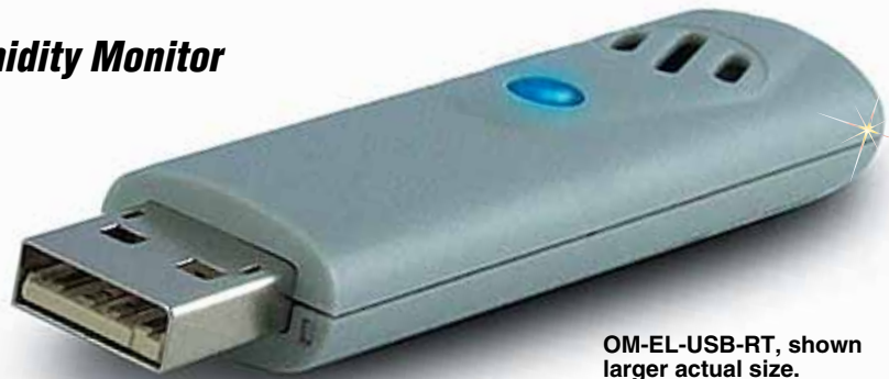
OM-EL-USB-RT, shown larger actual size.