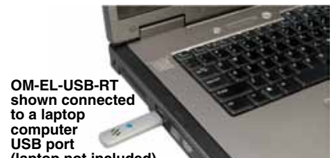
OM-EL-USB-RT shown connected to a laptop computer USB port (laptop not included).