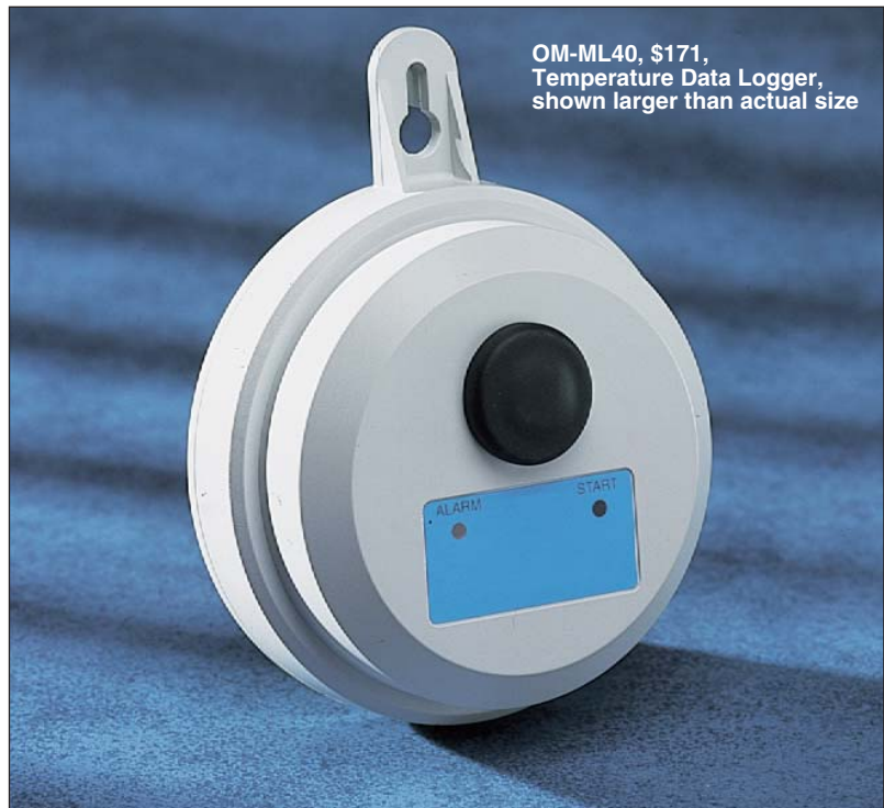
OM-ML40, $171, Temperature Data Logger, shown larger than actual size